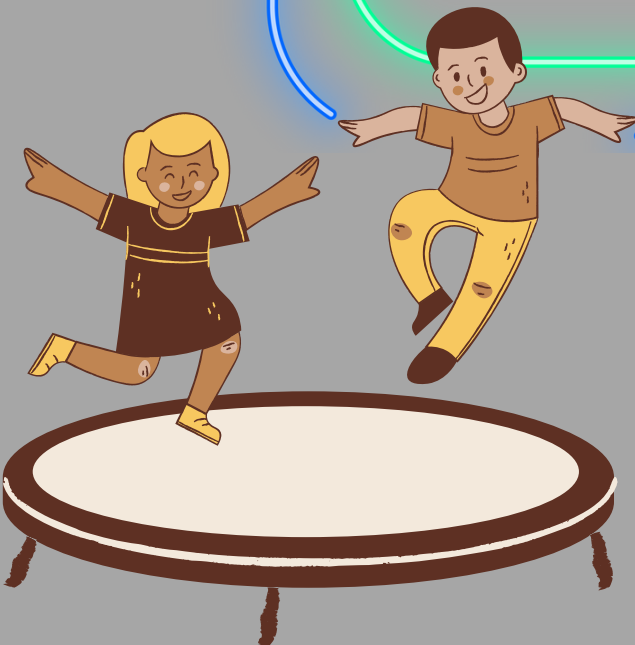
Sense of body movement through space