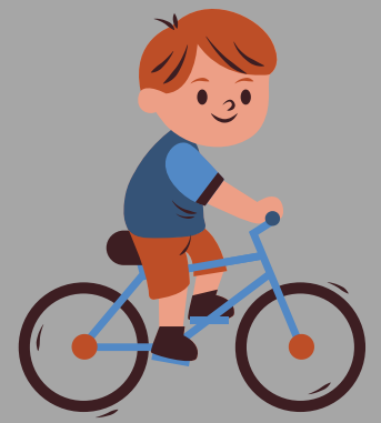
Determine direction and speed of movement