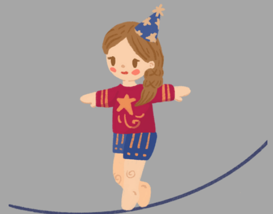
Maintaining head and body position